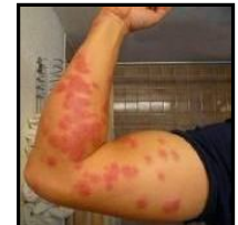
Welts from bed bug bites