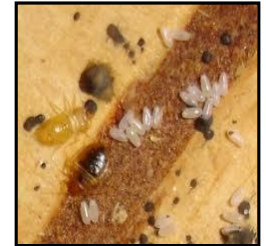
Bed bug eggs and cast skins