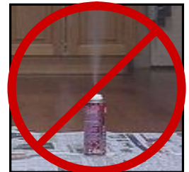
Do not use foggers