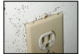
Fecal spots by outlet cover