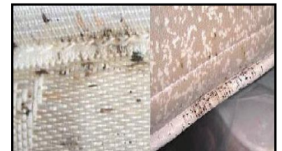
Blood stains and fecal spots on a mattress

Live bed bugs, eggs and cast skins indicate a bed bug infestation. Small black or rusty colored spots found on bed linens, pillows, or the mattress may be blood spots and bed bug droppings.