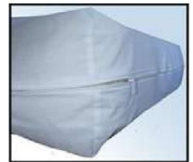
A zippered bed bug proof cover can help protect against bed bugs